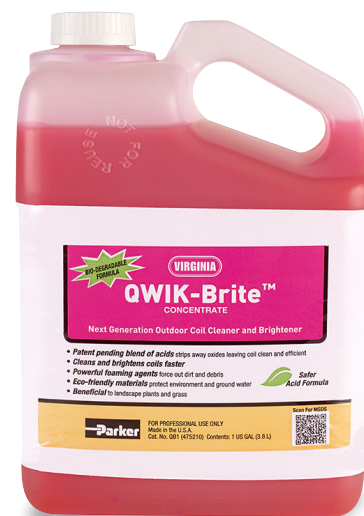
Catalog No. QB1

No. QWIK-Brite has not been submitted to USDA for acceptance.