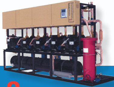
2 DESIGN CAD Model