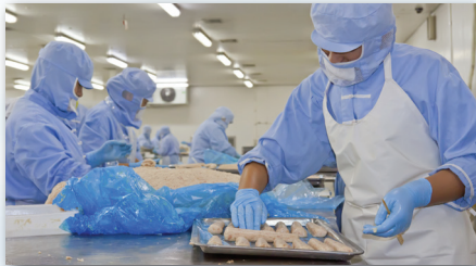
Food Processing Plants