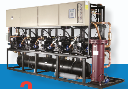
3 REALIZE Actual Product

First we visualize, then we design. Heatcraft starts with your ideas and custom configures the components on the racks to create a product that fits your unique project requirements. All you have to do is contact your Heatcraft Sales Representative to get the process started.