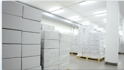
Blast Cooling & Freezing