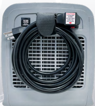
10' locking power cable and Velcro cord wrap