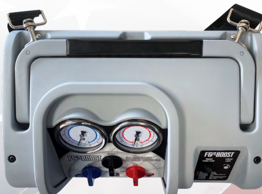
Rugged recessed handle for storage