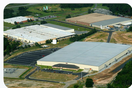
Tifton, Georgia 540,000 ft 2