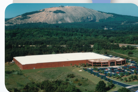
Stone Mountain, Georgia 65,000 ft 2