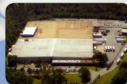
Columbus, Georgia 750,000 ft 2